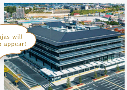
City Hall completed in November 2018