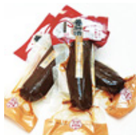
Yokanzuke aged for two years