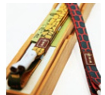
Obijime (kimono cord)