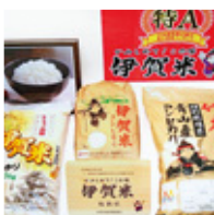
Iga Rice Koshihikari