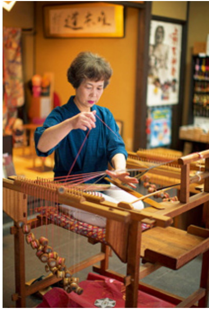
Iga Kumihimo (braided cords)