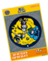
Card with a manhole cover design