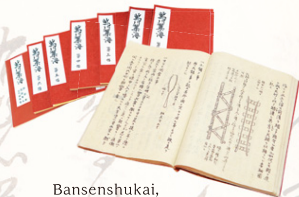
Bansenshukai, a book on ninjutsu

This is a book on ninjutsu written by a descendent of the Iga ninja.