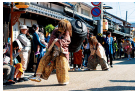
Procession of demons

This glamorous festival features portable shrines, Danjiri floats and many Gionbana, an ornament with a paper flower curtain.