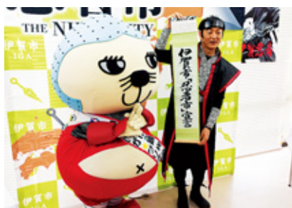
Declaration of the Ninja City by Mayor Okamoto

Iga City declared itself a ninja city with the aim of attracting tourists and promoting urban development by succeeding and spreading the history, culture, and spirit of the ninja. To that end, we conduct a variety of efforts, such as events and the publication of research findings.