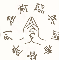
Kuji goshincho (method of self-defense using nine syllables)

This is an occult art that enables a person to fly if the person seeks divine assistance.