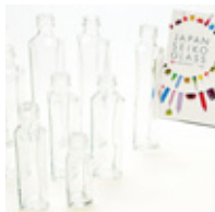
Glass Bottles SS Heart