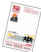
New Year's Postcard