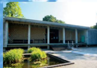
Basso Memorial Museum

This is a hermitage established by one of the disciples of Matsuo Basso.