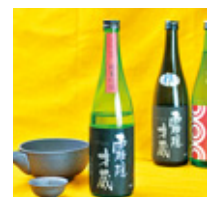
Ginjoshu with no alcohol added, Kirigakure Saizo

There are various other certified Prpducts!