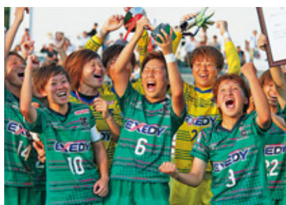
Iga Football Club Kunoichi