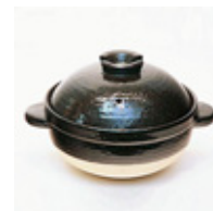
Iga ware earthen rice cooker, Kamado-san