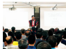
Extension Lecture for Citizens

Task of the Ninja Let's watch the Ninja City channel!