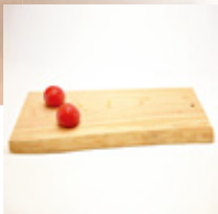
Cutting Board made from cypress grown in Iga