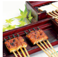
Kinome (leaf bud) Tofu Dengaku