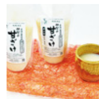
Non-diluted Iga Amazake